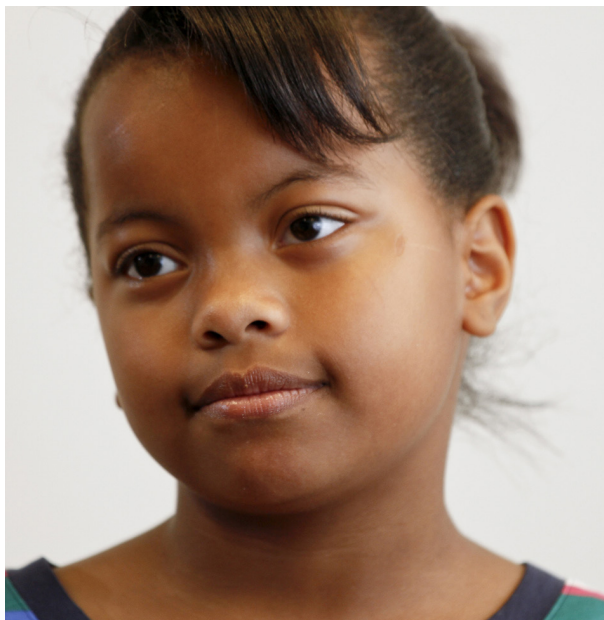
ACUTE LEUKEMIA TREATMENT