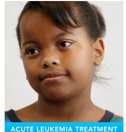
ACUTE LEUKEMIA TREATMENT